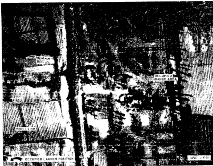
UNCLASSIFIED BY YARD NW AND V.44 TRANSPARENT STORAGE AREA, NORTH VIETNAM