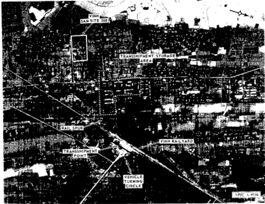
VINH SAM SITE A25-21268, NORTH VIETNAM